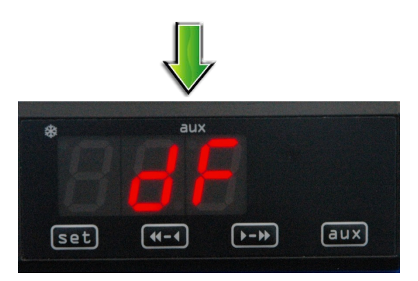
By holding "◀◀ - ◀ "and "▶ - ▶▶" buttons together this forces the fridge into defrost mode for the programmed time and will then continue its normal operation.

"dF" stands for defrost. Standard programming ensures the fridge defrosts for 6 minutes every 8 hours to prevent ice buildup. This is not an error message.